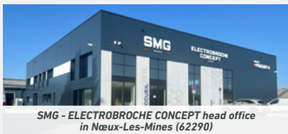
SMG - ELECTROBROCHE CONCEPT head office in Nœux-Les-Mines (62290)

For manufacturers wishing to modernise their machine tools, this partnership offers a global solution for optimising their machining strategy.